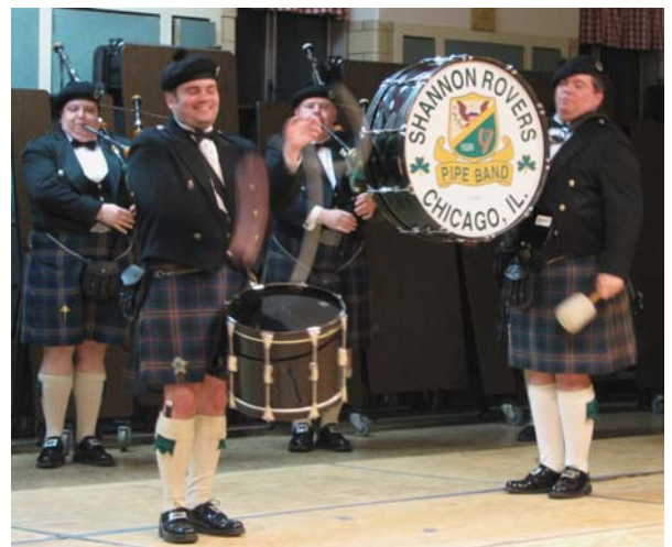
How could there be a St. Pat's Party without the Shannon Rovers?

is celebrated on Saturdays, after the 8:15 am Eucharist until 9:30 am, in the sacristy near the front doors of the Church during the Holy Hour. Communal Reconciliation Services are held during Advent and Lent.