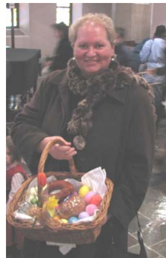
Blessing of the Easter Baskets

is celebrated on Saturdays, after the 8:15 am Eucharist until 9:30 am, in the sacristy near the front doors of the Church during the Holy Hour. Communal Reconciliation Services are held during Advent and Lent.