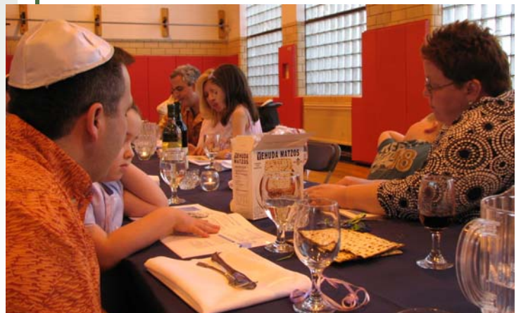
The Seder meal last Sunday at St. A's.

is celebrated on Saturdays, after the 8:15 am Eucharist until 9:30 am, in the sacristy near the front doors of the Church during the Holy Hour. Communal Reconciliation Services are held during Advent and Lent.