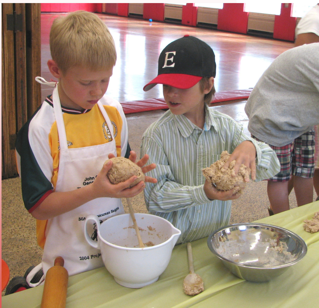
1st Communion candidates - Sunday morning bread makers

"Do this in memory of Me." We, the members of the Catholic Community of St. Athanasius Parish, are each called by baptism to continue the work of Jesus Christ embracing all. We aspire to worship, love, thank and serve God. We are open to what God calls us to become.