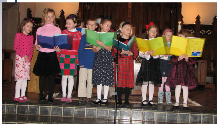
Our Christmas Carol Choir

is celebrated on Saturdays, after the 8:15 am Eucharist until 9:30 am, in the sacristy near the front doors of the Church during the Holy Hour. Communal Reconciliation Services are held during Advent and Lent.