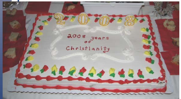
Our Pentecost Birthday Party

is celebrated on Saturdays, after the 8:15 am Eucharist until 9:30 am, in the sacristy near the front doors of the Church during the Holy Hour. Communal Reconciliation Services are held during Advent and Lent.