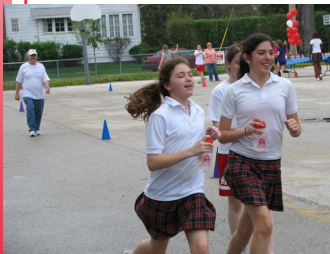
Walkers and Runners a school fundraiser

is celebrated on Saturdays, after the 8:15 am Eucharist until 9:30 am, in the sacristy near the front doors of the Church during the Holy Hour. Communal Reconciliation Services are held during Advent and Lent.