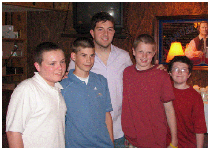
Rex Grossman, Chicago Bears QB, scouting for future teammates at school sports banquet

is celebrated on Saturdays, after the 8:15 am Eucharist until 9:30 am, in the sacristy near the front doors of the Church during the Holy Hour. Communal Reconciliation Services are held during Advent and Lent.