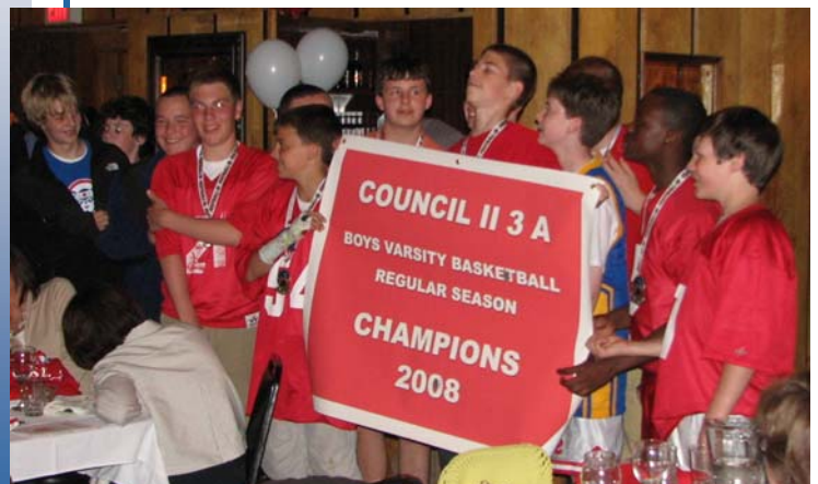
Sports Banquet Basketball Champs

is celebrated on Saturdays, after the 8:15 am Eucharist until 9:30 am, in the sacristy near the front doors of the Church during the Holy Hour. Communal Reconciliation Services are held during Advent and Lent.