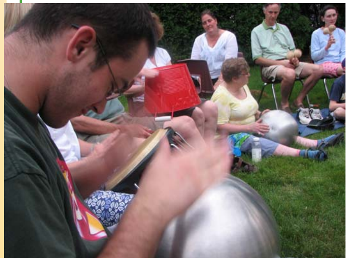
Last Monday's Drumming Circle of Prayer and Meditation on the Lawn

is celebrated on Saturdays, after the 8:15 am Eucharist until 9:30 am, in the sacristy near the front doors of the Church during the Holy Hour. Communal Reconciliation Services are held during Advent and Lent.