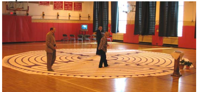
Pilgrims walking labyrinth meditation

is celebrated on Saturdays, after the 8:15 am Eucharist until 9:30 am, in the sacristy near the front doors of the Church during the Holy Hour. Communal Reconciliation Services are held during Advent and Lent.