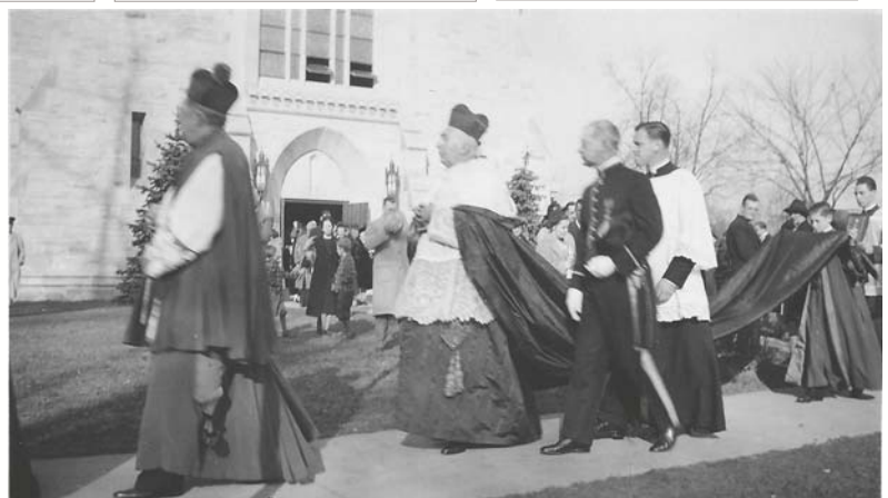
Cardinal Mundelein at the dedication of our new Church building, November 7, 1937

All who are interested in defining, shaping and implementing the Faith Development goals are invited to the next Parish Leadership Night on July 12 at 7:00 pm.