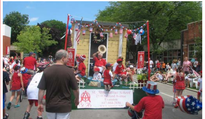
On the move

is celebrated on Saturdays, after the 8:15 am Eucharist until 9:30 am, in the sacristy near the front doors of the Church during the Holy Hour. Communal Reconciliation Services are held during Advent and Lent.