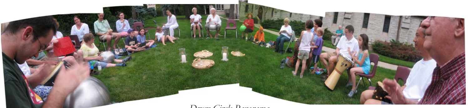
Drum Circle Panorama June 21, 2010