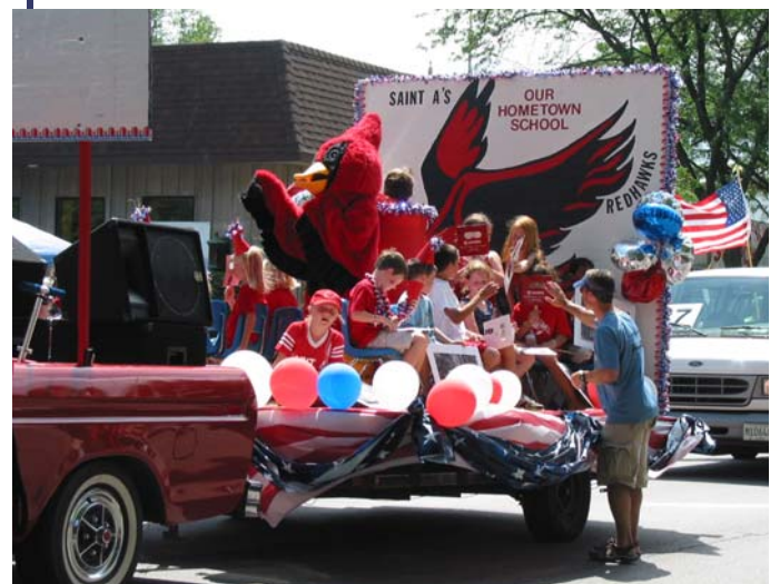
Students show school spirit in the 4th of July parade

is celebrated on Saturdays, after the 8:15 am Eucharist until 9:30 am, in the sacristy near the front doors of the Church during the Holy Hour. Communal Reconciliation Services are held during Advent and Lent.