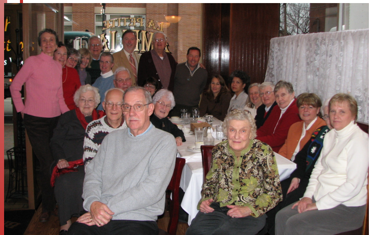
Thank You to our Parish House Volunteers

is celebrated on Saturdays, after the 8:15 am Eucharist until 9:30 am, in the sacristy near the front doors of the Church during the Holy Hour. Communal Reconciliation Services are held during Advent and Lent.