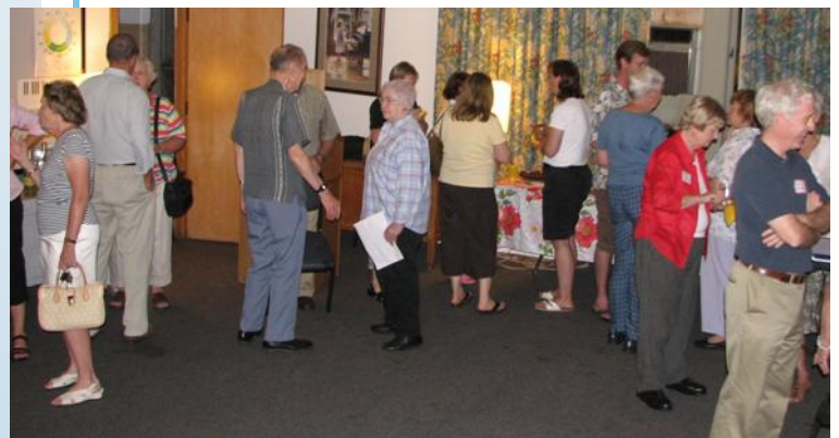
St. A's Liturgical, Eucharistic & Hospitality Ministry Volunteers Party On!

is celebrated on Saturdays, after the 8:15 am Eucharist until 9:30 am, in the sacristy near the front doors of the Church during the Holy Hour. Communal Reconciliation Services are held during Advent and Lent.