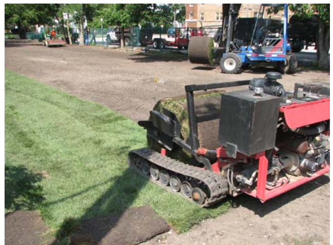
Laying the turf on Lindley Park

is celebrated on Saturdays, after the 8:15 am Eucharist until 9:30 am, in the sacristy near the front doors of the Church during the Holy Hour. Communal Reconciliation Services are held during Advent and Lent.