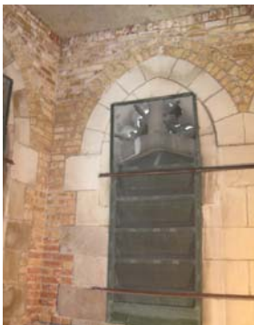
Inside the Bell Tower

Two of the exterior buttresses on the east side of the Church (where we have seen extensive spalling and deterioration on the inside of the Church) have been stripped for further inspection, and will be rebuilt. Coring samples have been taken at the base of the wood columns, and testing has been conducted to evaluate the nature and extent of any wood decay. A third buttress, where there is no visible evidence of damage, will also be inspected.