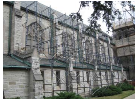
The West Elevation of the Church

The inspection of the structural columns, from a boom lift set up inside the Church on July 29, allowed for a close-up inspection of the condition of those columns, and confirmed that our drawings are accurate and that, while there has been some movement in the wood in the building's history, there is no evidence of any recent movement.