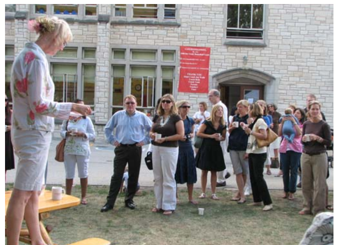
Coffee and...after the school dropoff

is celebrated on Saturdays, after the 8:15 am Eucharist until 9:30 am, in the sacristy near the front doors of the Church during the Holy Hour. Communal Reconciliation Services are held during Advent and Lent.