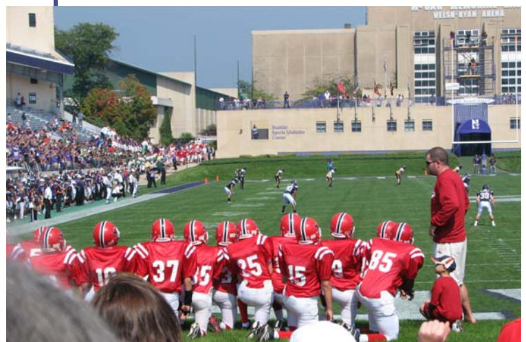
Ryan Field half-time exhibition debut of St. A's teams at Northwestern's season opener

is celebrated on Saturdays, after the 8:15 am Eucharist until 9:30 am, in the sacristy near the front doors of the Church during the Holy Hour. Communal Reconciliation Services are held during Advent and Lent.