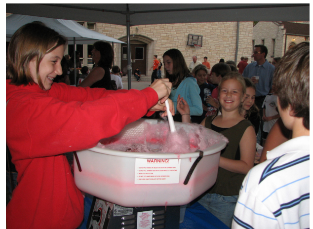
Kids enjoy Oktoberfest Cotton Candy

is celebrated on Saturdays, after the 8:15 am Eucharist until 9:30 am, in the sacristy near the front doors of the Church during the Holy Hour. Communal Reconciliation Services are held during Advent and Lent.