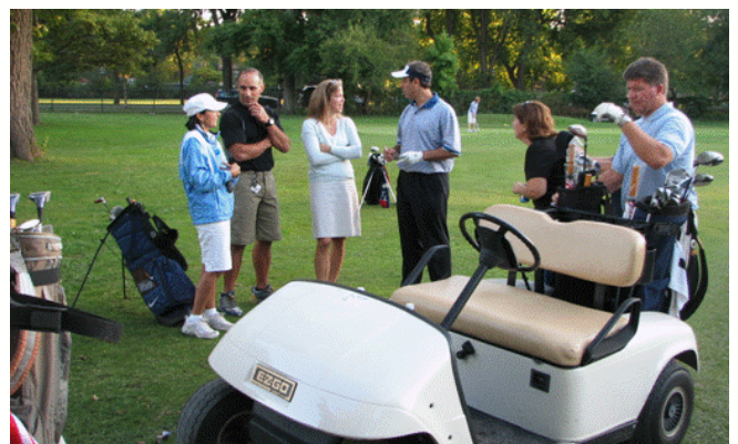
Moments for strategy at the Parish Golf Outing

is celebrated on Saturdays, after the 8:15 am Eucharist until 9:30 am, in the sacristy near the front doors of the Church during the Holy Hour. Communal Reconciliation Services are held during Advent and Lent.