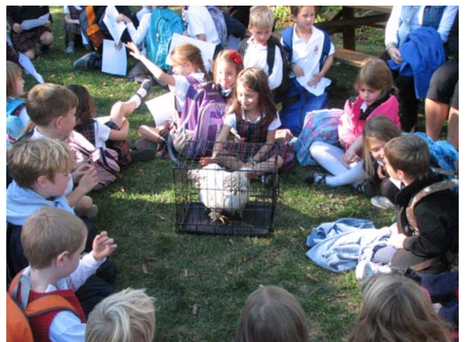
All creatures great and small show up for the blessing of pets.

is celebrated on Saturdays, after the 8:00 am Eucharist until 9:30 am, in the sacristy near the front doors of the Church during the Holy Hour. Communal Reconciliation Services are held during Advent and Lent.