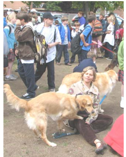
Comforting friends at the pet blessing

is celebrated on Saturdays, after the 8:15 am Eucharist until 9:30 am, in the sacristy near the front doors of the Church during the Holy Hour. Communal Reconciliation Services are held during Advent and Lent.