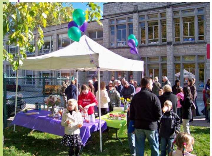
Generations Hospitality at Lindley Park

is celebrated on Saturdays, after the 8:15 am Eucharist until 9:30 am, in the sacristy near the front doors of the Church during the Holy Hour. Communal Reconciliation Services are held during Advent and Lent.