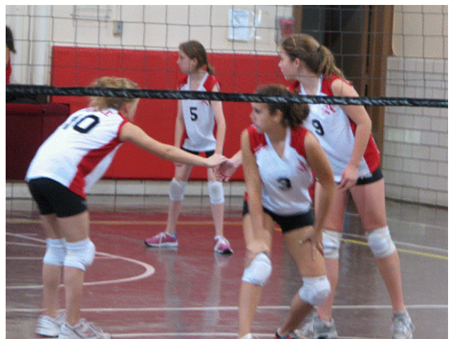
Varsity Volleyball waiting for the serve

is celebrated on Saturdays, after the 8:15 am Eucharist until 9:30 am, in the sacristy near the front doors of the Church during the Holy Hour. Communal Reconciliation Services are held during Advent and Lent.