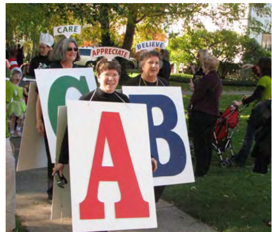
Our School's Halloween Parade

is celebrated on Saturdays, after the 8:15 am Eucharist until 9:30 am, in the sacristy near the front doors of the Church during the Holy Hour. Communal Reconciliation Services are held during Advent and Lent.