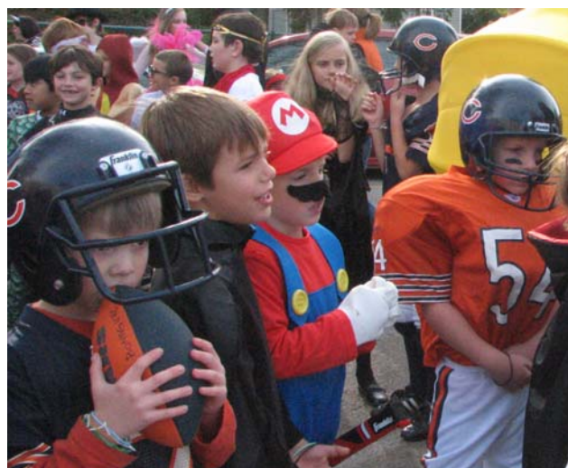
Halloween Parade at St. A's.

is celebrated on Saturdays, after the 8:00 am Eucharist until 9:30 am, in the sacristy near the front doors of the Church during the Holy Hour. Communal Reconciliation Services are held during Advent and Lent.