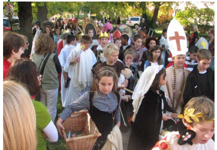
A Halloween school parade of saints

is celebrated on Saturdays, after the 8:15 am Eucharist until 9:30 am, in the sacristy near the front doors of the Church during the Holy Hour. Communal Reconciliation Services are held during Advent and Lent.