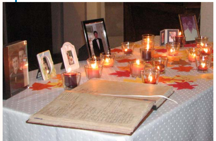
All Souls Table of Remembrance

is celebrated on Saturdays, after the 8:00 am Eucharist until 9:30 am, in the sacristy near the front doors of the Church during the Holy Hour. Communal Reconciliation Services are held during Advent and Lent.