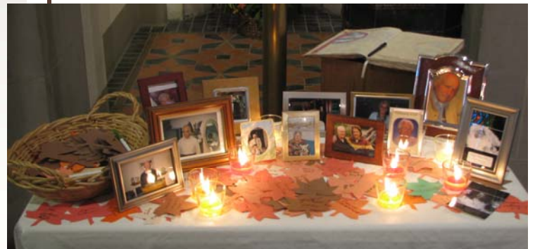
Our All Souls Shrine of remembering and hope

is celebrated on Saturdays, after the 8:15 am Eucharist until 9:30 am, in the sacristy near the front doors of the Church during the Holy Hour. Communal Reconciliation Services are held during Advent and Lent.