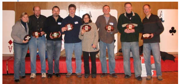
Poker Night Winners

is celebrated on Saturdays, after the 8:15 am Eucharist until 9:30 am, in the sacristy near the front doors of the Church during the Holy Hour. Communal Reconciliation Services are held during Advent and Lent.