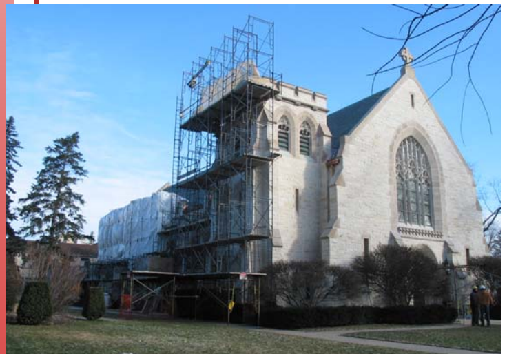
The scaffolding is coming down!

is celebrated on Saturdays, after the 8:15 am Eucharist until 9:30 am, in the sacristy near the front doors of the Church during the Holy Hour. Communal Reconciliation Services are held during Advent and Lent.