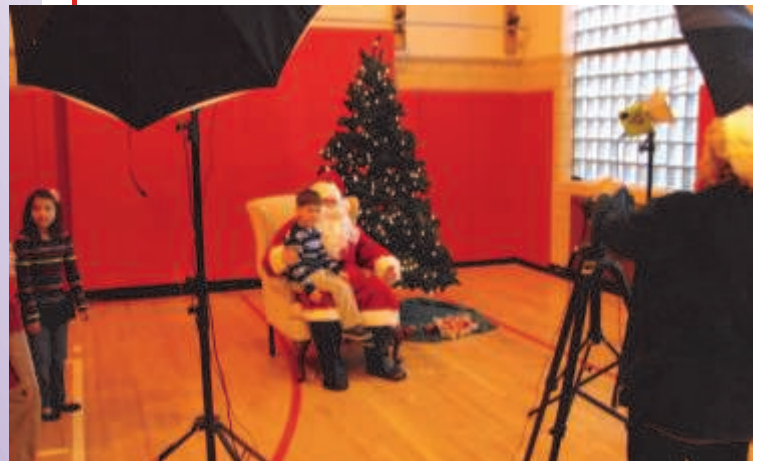
Quality time with Santa arranged by our Life Teen Ministry

is celebrated on Saturdays, after the 8:00 am Eucharist until 9:30 am, in the sacristy near the front doors of the Church during the Holy Hour. Communal Reconciliation Services are held during Advent and Lent.