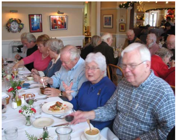
An appreciation luncheon for our Parish House volunteers

is celebrated on Saturdays, after the 8:15 am Eucharist until 9:30 am, in the sacristy near the front doors of the Church during the Holy Hour. Communal Reconciliation Services are held during Advent and Lent.