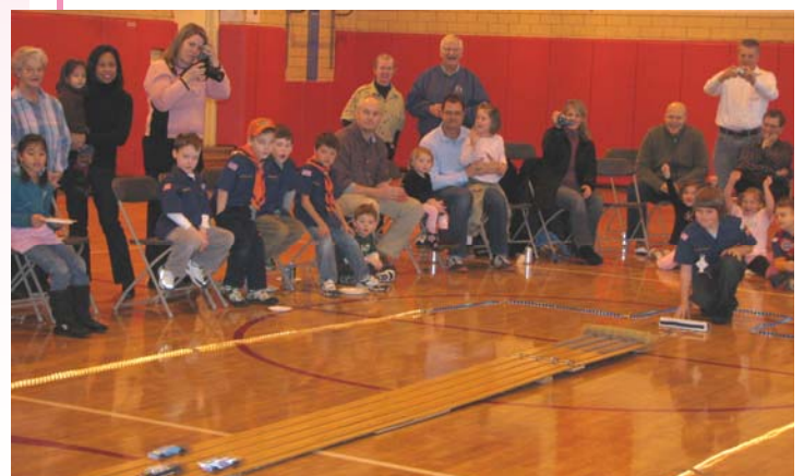
Cub Scout Pinewood Derby Hot Cars

is celebrated on Saturdays, after the 8:15 am Eucharist until 9:30 am, in the sacristy near the front doors of the Church during the Holy Hour. Communal Reconciliation Services are held during Advent and Lent.