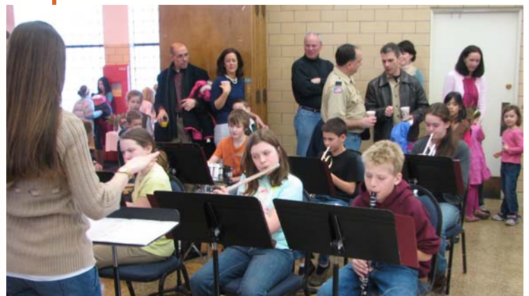
The Fine Arts portion of the Pancake Breakfast.

is celebrated on Saturdays, after the 8:15 am Eucharist until 9:30 am, in the sacristy near the front doors of the Church during the Holy Hour. Communal Reconciliation Services are held during Advent and Lent.