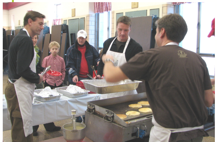
Pancake Breakfast: Griddle Hot!

is celebrated on Saturdays, after the 8:15 am Eucharist until 9:30 am, in the sacristy near the front doors of the Church during the Holy Hour. Communal Reconciliation Services are held during Advent and Lent.