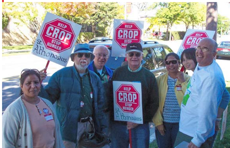
CROP Walk, 2005

is celebrated on Saturdays, after the 8:15 am Eucharist until 9:30 am, in the sacristy near the front doors of the Church during the Holy Hour. Communal Reconciliation Services are held during Advent and Lent.