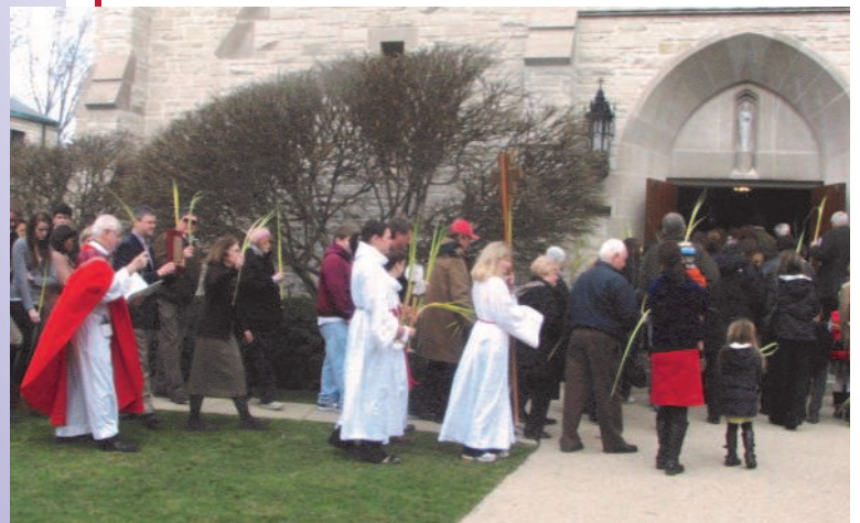
Processing with Palms

is celebrated on Saturdays, after the 8:00 am Eucharist until 9:30 am, in the sacristy near the front doors of the Church during the Holy Hour. Communal Reconciliation Services are held during Advent and Lent.