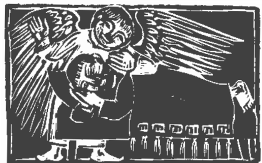
THE ANGELOF THE LORD APPEARED IN A DREAM: MT 1:20