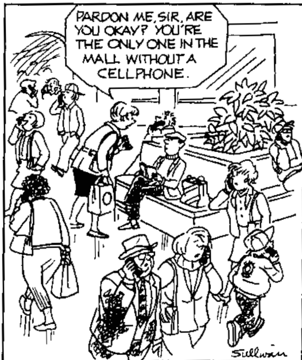
from The Joyful Noiseletter ©Ed Sullivan Reprinted with permission