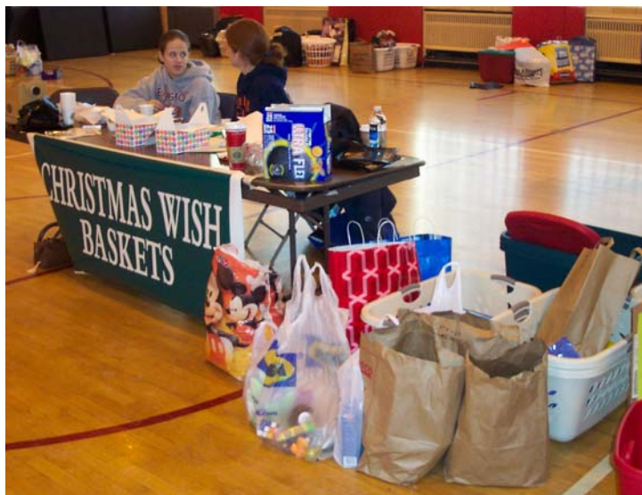
Thanks to all who helped with the Christmas Wish Basket Drive

is celebrated on Saturdays, after the 8:15 am Eucharist until 9:30 am, in the sacristy near the front doors of the Church during the Holy Hour. Communal Reconciliation Services are held during Advent and Lent.