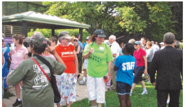
9/11 Peaceable Cities: 450 people walking and talking in Evanston

is celebrated on Saturdays, after the 8:00 am Eucharist until 9:30 am, in the sacristy near the front doors of the Church during the Holy Hour. Communal Reconciliation Services are held during Advent and Lent.