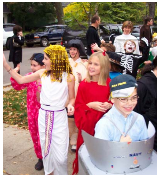
The Halloween Parade

is celebrated on Saturdays, after the 8:15 am Eucharist until 9:30 am, in the sacristy near the front doors of the Church during the Holy Hour. Communal Reconciliation Services are held during Advent and Lent.