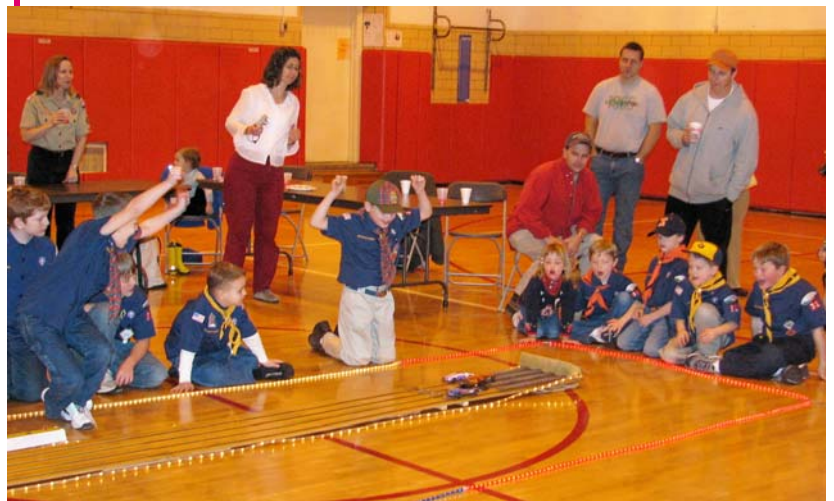
A photo finish in the Cub Scout Pinewood Derby

is celebrated on Saturdays, after the 8:15 am Eucharist until 9:30 am, in the sacristy near the front doors of the Church during the Holy Hour. Communal Reconciliation Services are held during Advent and Lent.